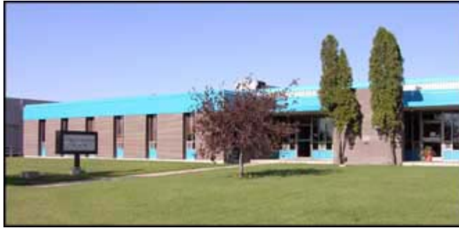
Venmar CES Inc. Saskatoon, SK, Canada

Venmar CES Inc. has been manufacturing energy recovery equipment since 1952 from its two manufacturing facilities located in Canada at Saskatoon, Saskatchewan and St-Léonard-d'Aston, Quebec. Founded on a dedication to provide cost-effective commercial ventilation, Venmar CES devotes its time and energy to designing a variety of ventilation products to meet diverse needs. Over one million installations across North America carry the Venmar CES name.