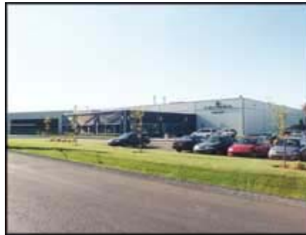
Venmar CES Inc. St-Léonard-d'Aston, QC, Canada

Venmar CES takes pride in its research and development (R&D) efforts in the energy recovery industry. With over 5% of its annual sales devoted to research and development, Venmar CES is truly the leading edge manufacturer of energy recovery products. The R&D staff performs product tests using modern labs with AMCA accredited airflow performance chambers for noise analysis. These testing procedures give the customer assurance that ventilation systems designed and manufactured by Venmar CES will meet or exceed performance expectations.